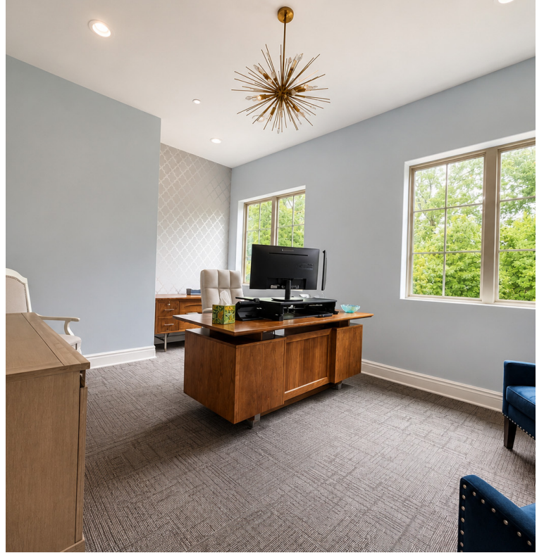
Interior Photos - 1784 W McDermott Drive, Suite 100