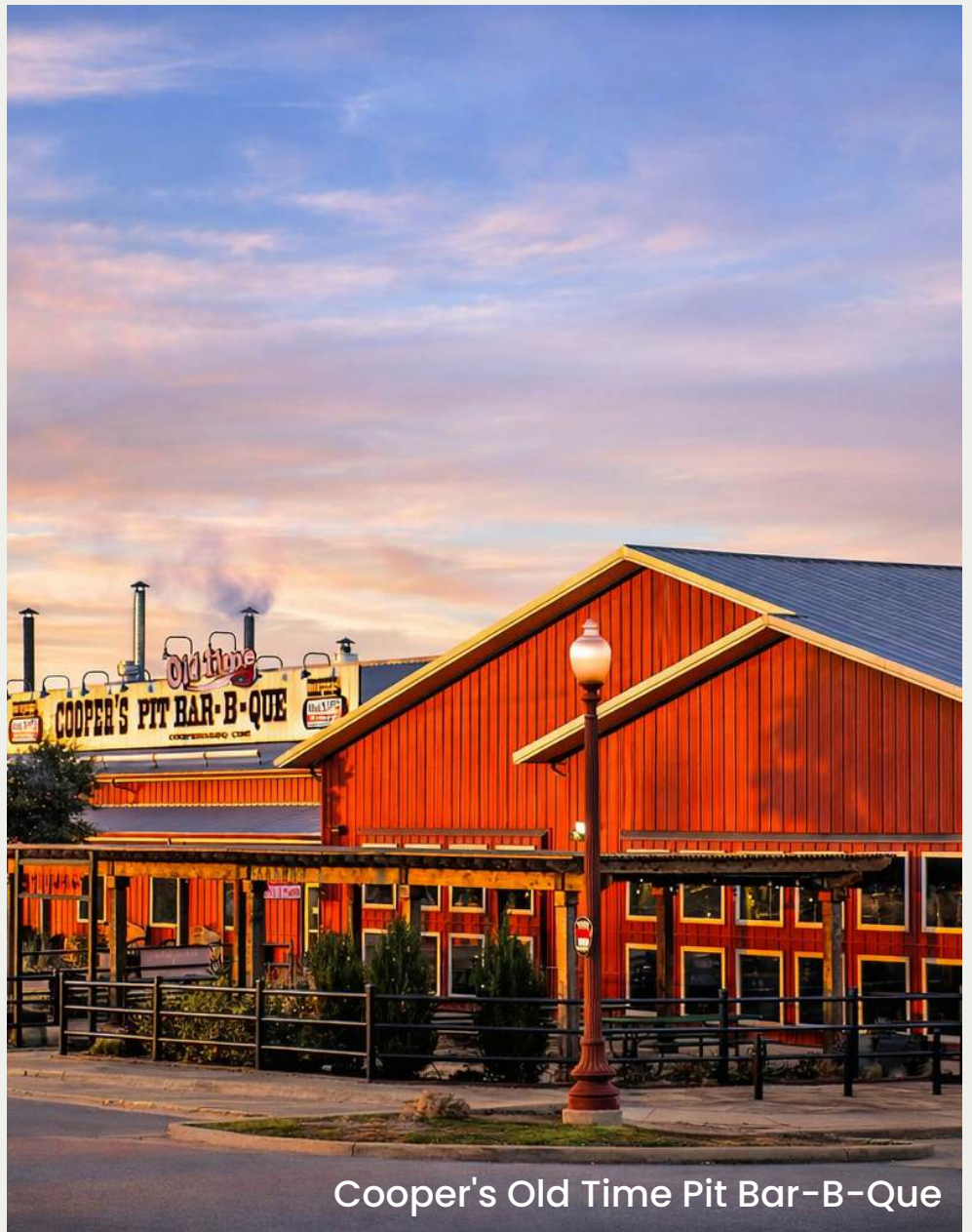
Cooper's Old Time Pit Bar-B-Que