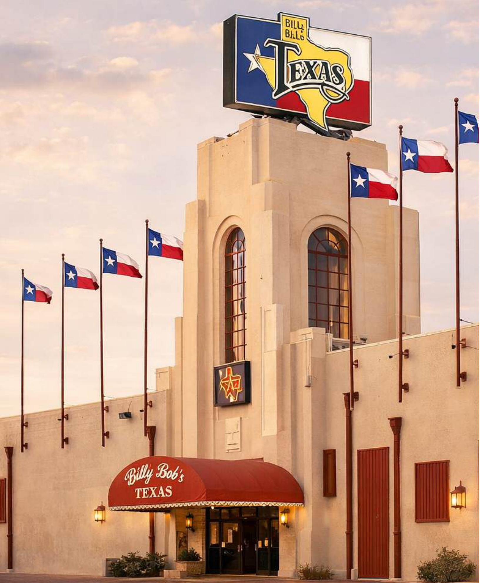
Billy Bob's Texas