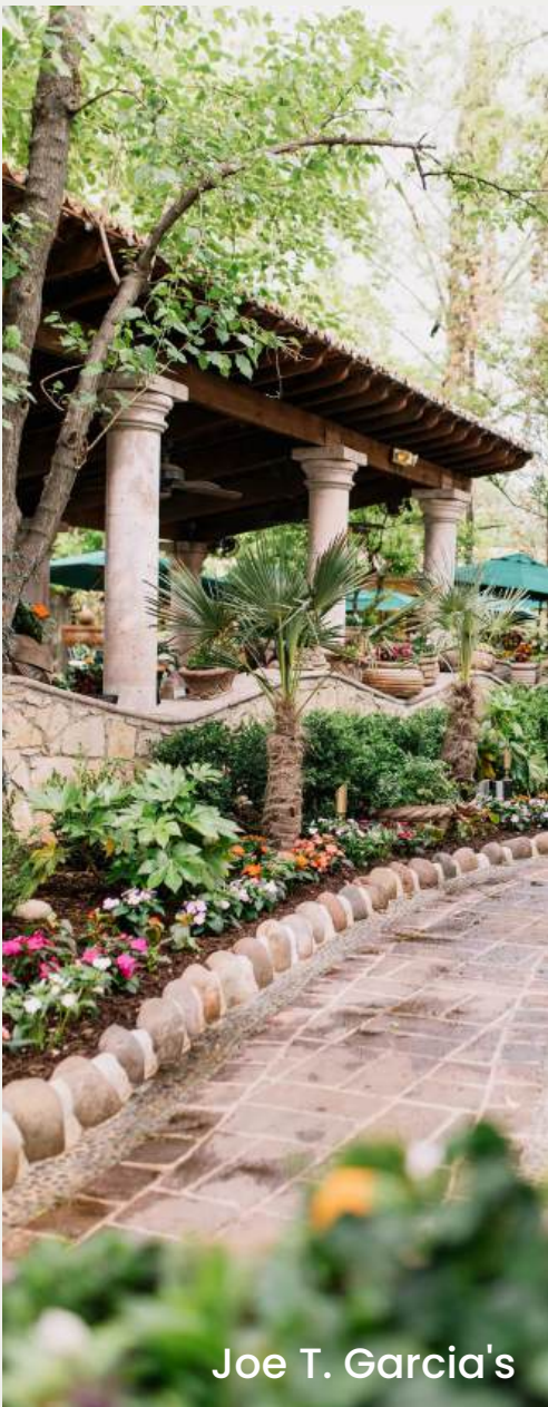
Joe T. Garcia's