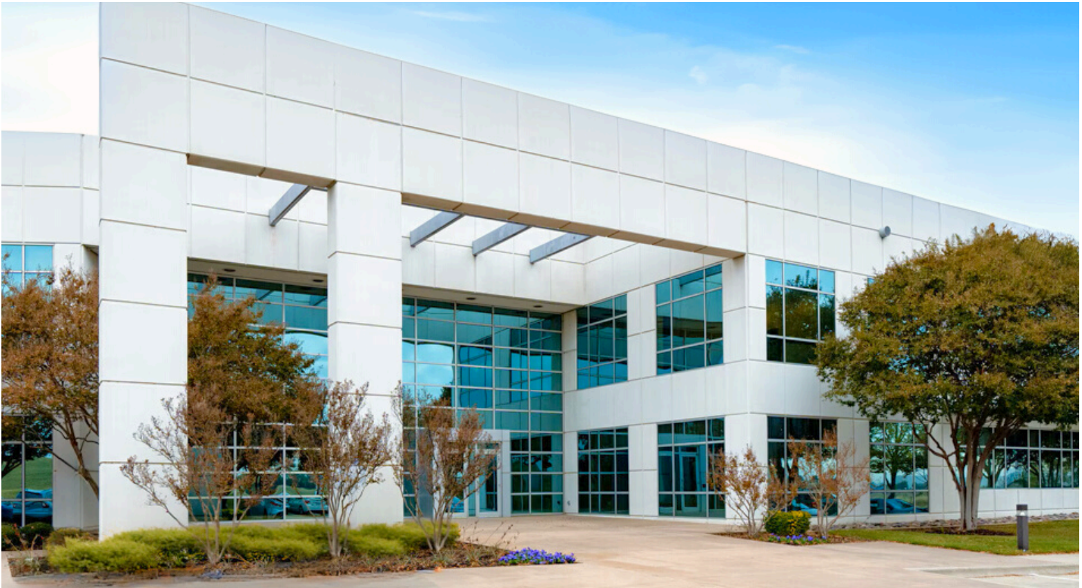
Easy access to entry

73,747 RSF total building area 36,874 RSF typical floorplate 4:1,000 parking ratio 1998 year built 2 stories