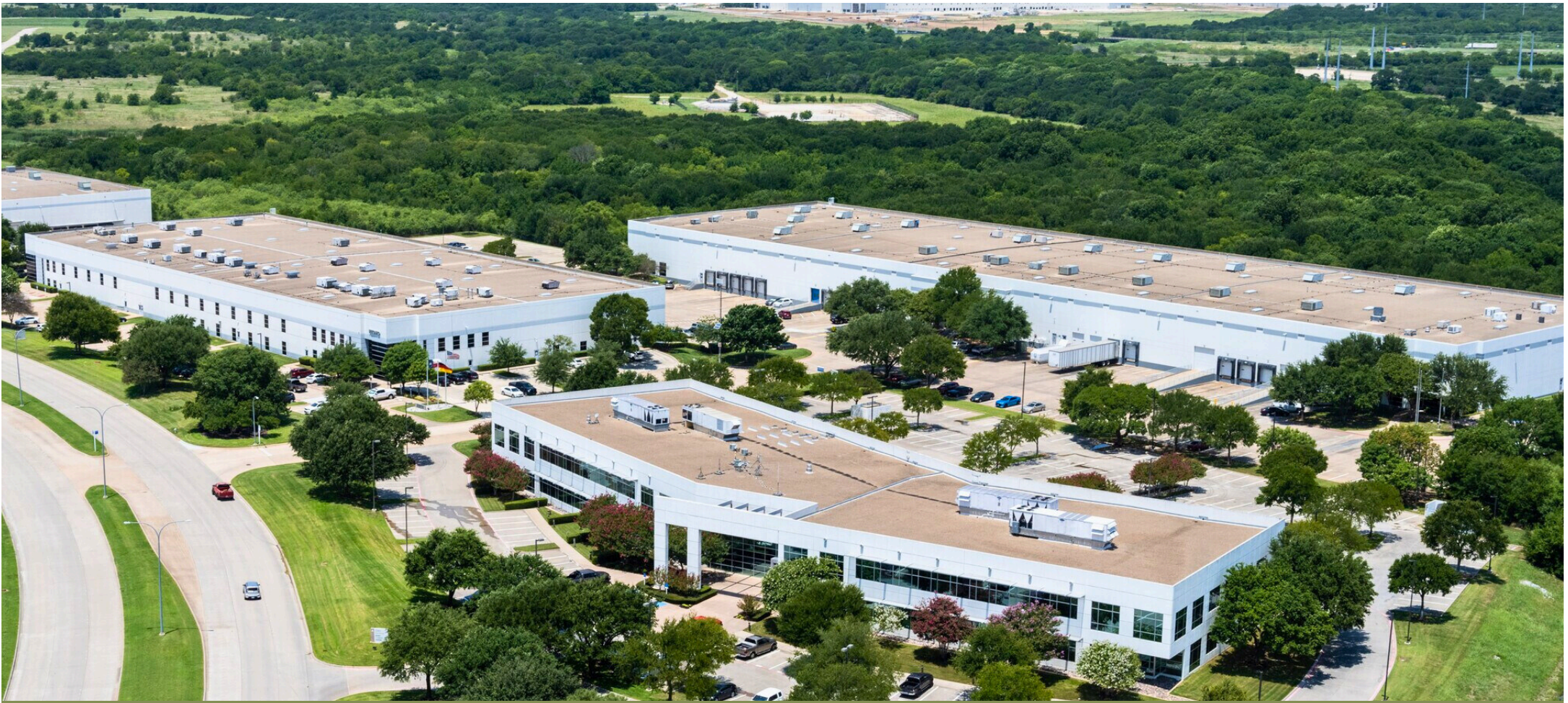
Located in AllianceTexas , home to 60+ Fortune 500 Companies