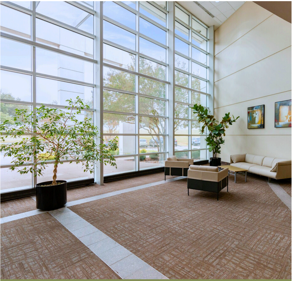
Floor to ceiling glass in the atrium