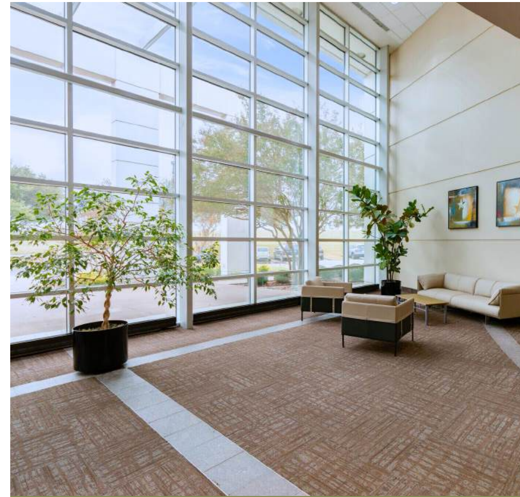
Floor to ceiling glass in the atrium