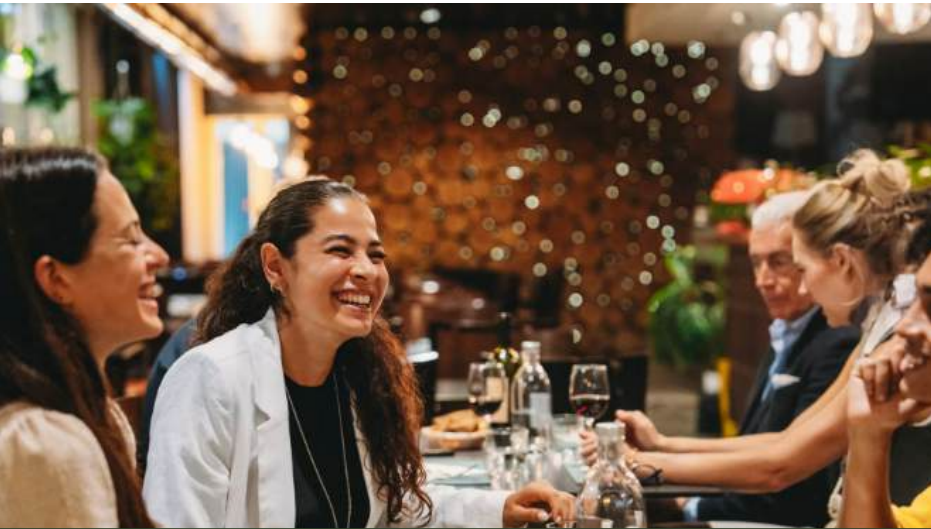
Many restaurant options minutes away

Whether you need to grab lunch, shop for a last-minute gift or squeeze in a workout, it's all here. And when business is done, the options for play are endless, from games to drinks to live music... even a NASCAR race.