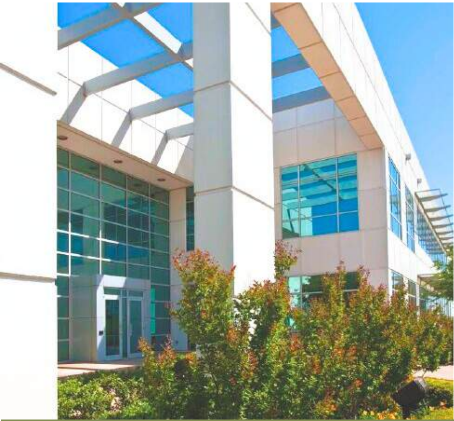
Ample surface parking for employees and visitors