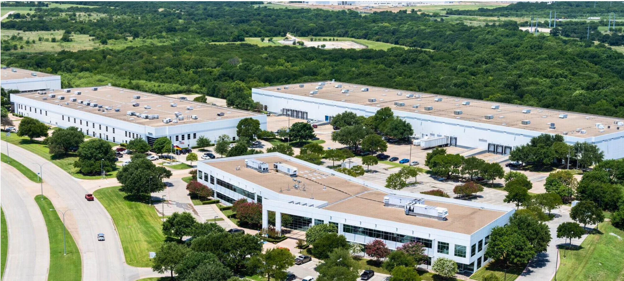
Located in AllianceTexas , home to 60+ Fortune 500 Companies