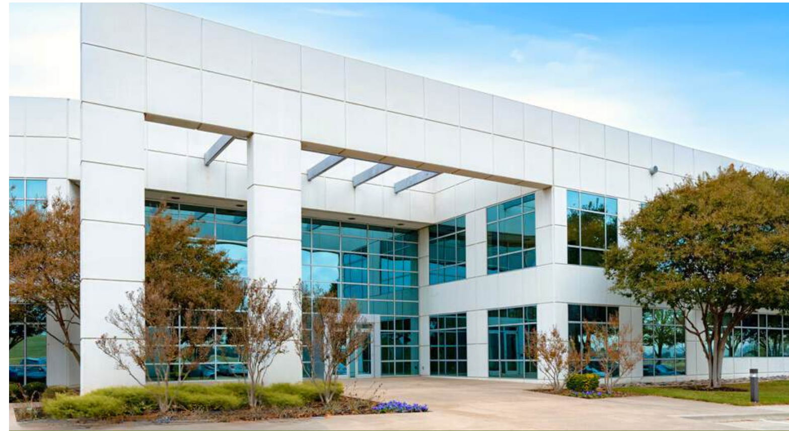
Easy access to entry