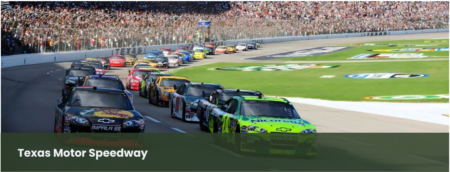
Texas Motor Speedway