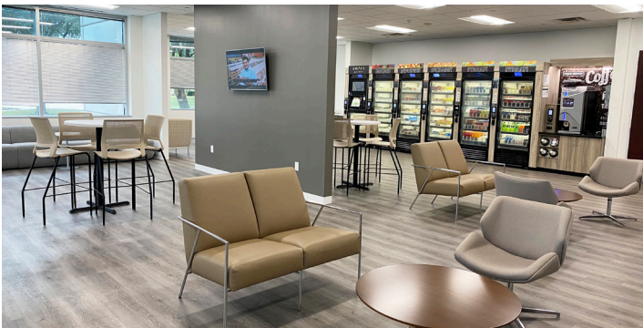
Tenant Lounge with free WiFi