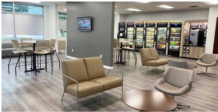
Tenant Lounge with free WiFi