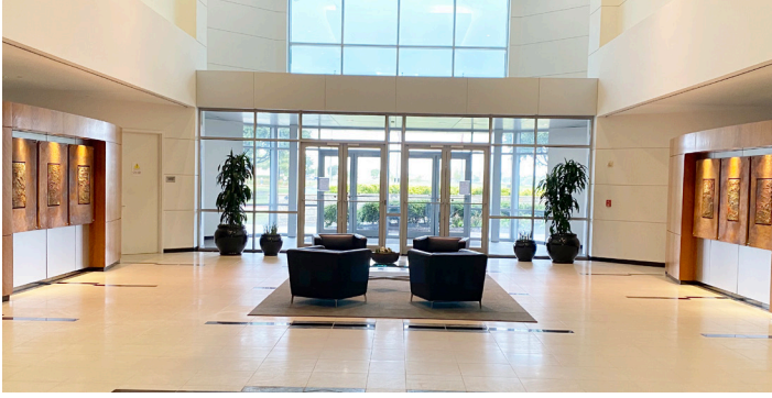
Spacious, Well-Appointed Lobby

Classroom Style Conference Facility with free WiFi Half Day: $75 / Full Day: $100 Accommodating Up To 70